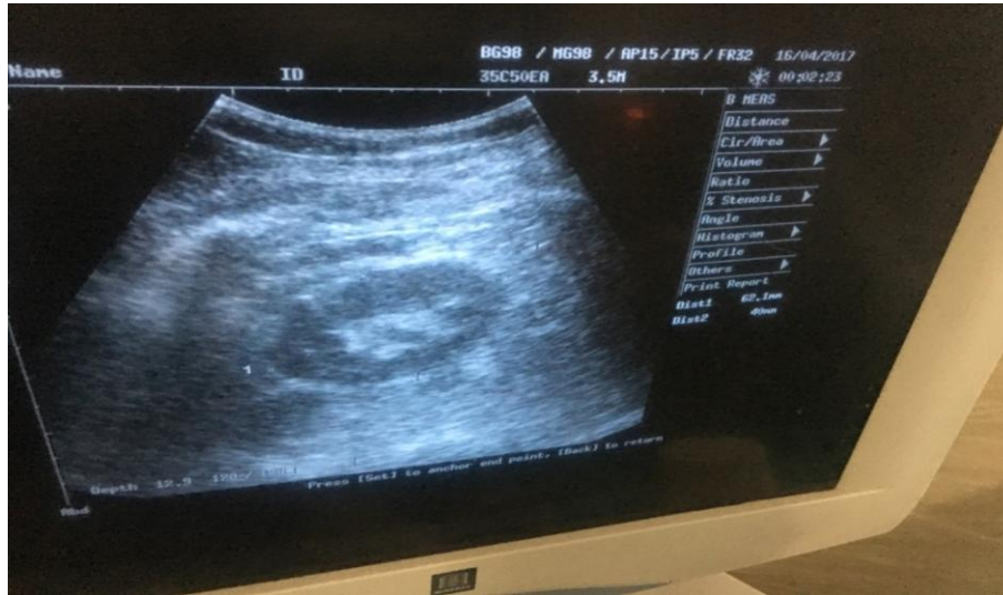
Fig.4. Sonography of Right kidney after tumor removal