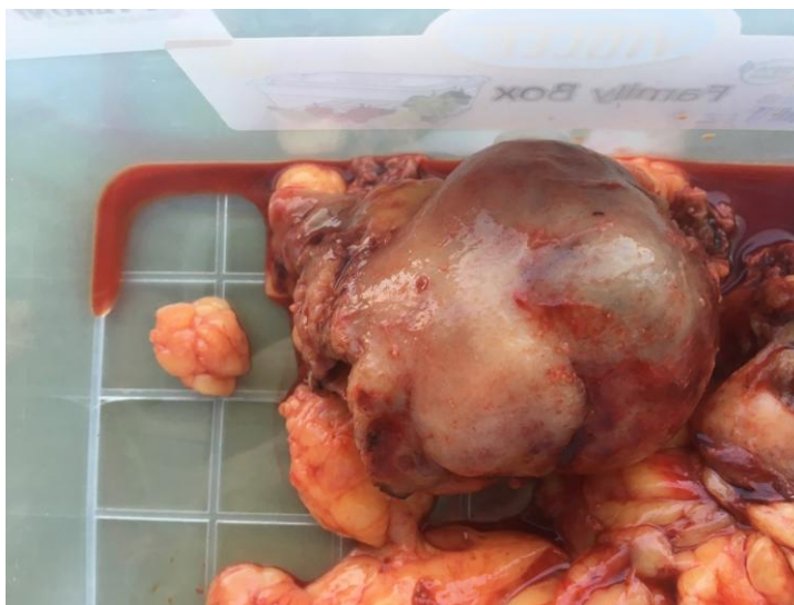
Fig.2. Completely removed tumor and perirenal tissue

The patient, even nine months after the operation, has a general stable condition without signs of recurrence and goes to dialysis twice a week.